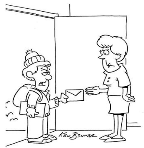
"What did I learn in school today, I learned my teacher has no sense of humor."